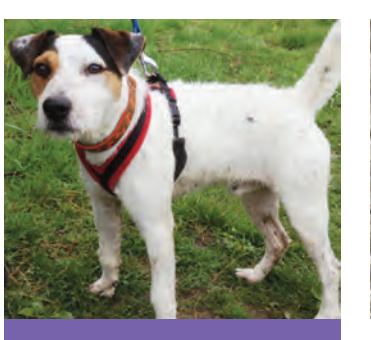
Jake We are looking for an experienced home without other dogs for this little Parsons Terrier Male | 2 years | Small/Medium

Potter Potter is a handsome golden crossbreed boy who is a very playful & affectionate young lad. Male | 1 year | Med/Large