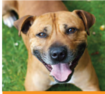
He is an extremely loving boy full of staffie exuberance and very cuddly. Male | 2 years | Medium

Gismo Gismo is a lovely little chihuahua cross boy who is looking for a home with older or no children. Male | 4 years | Small